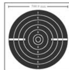
25 Meter Rapid Fire Pistol Target